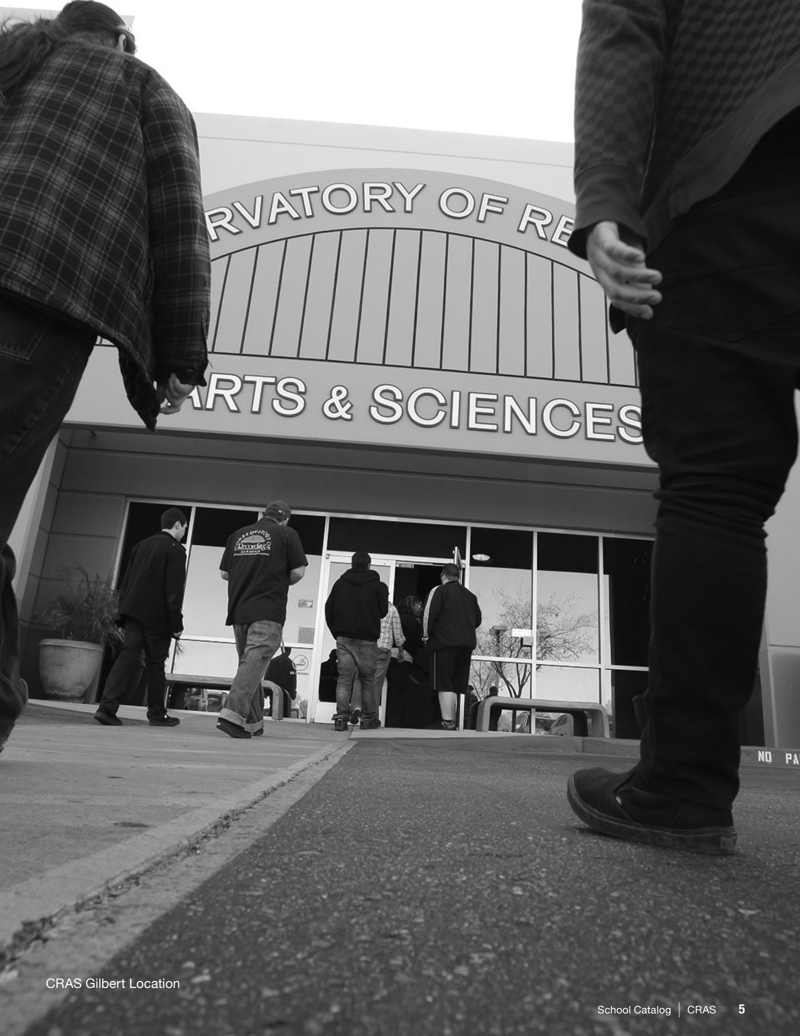
CRAS Gilbert Location