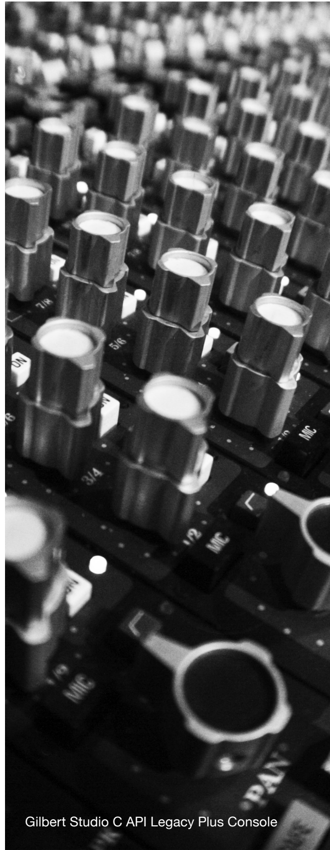
Gilbert Studio C API Legacy Plus Console

Resources on counseling for sex offense victims are available in Addendum C.